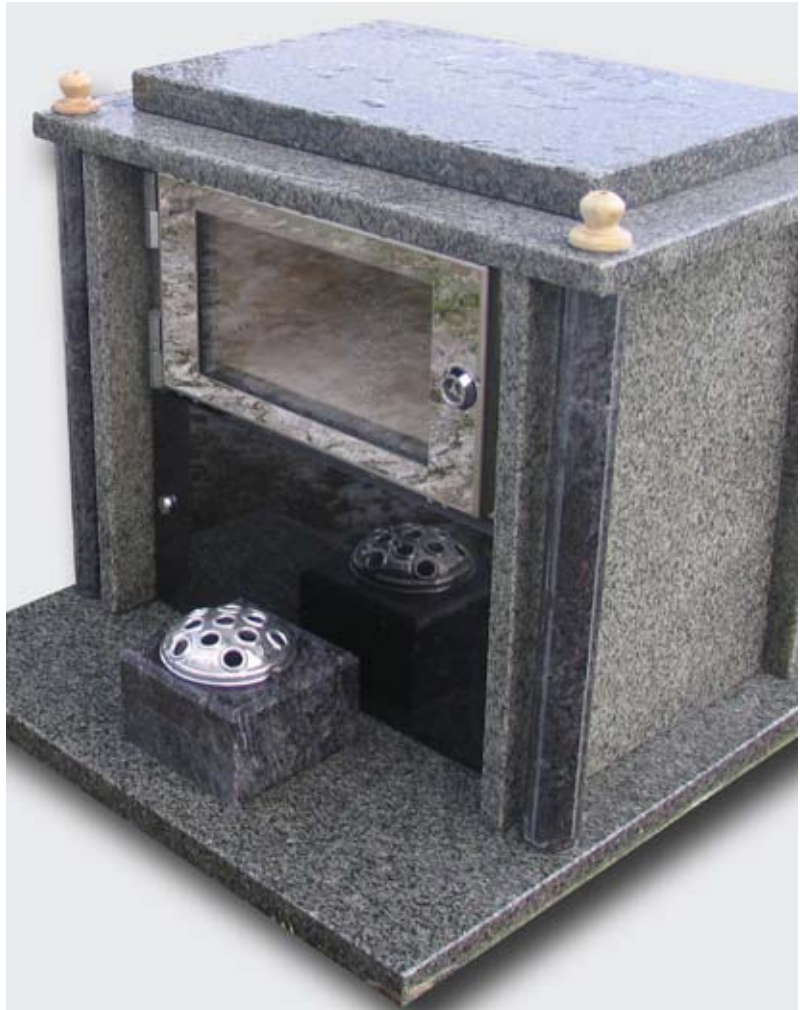
Page 5 of 13