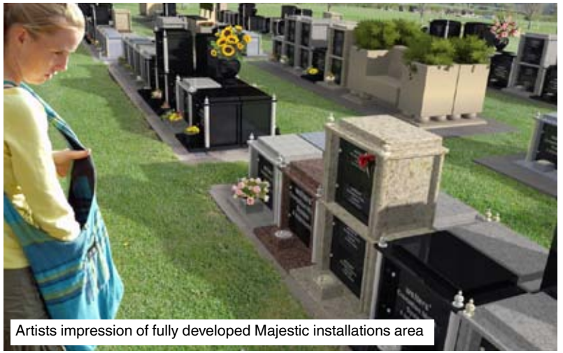
© welters organisation worldwide Page 4 of 13