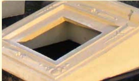
Access to the vault is made through the Desktop housing.