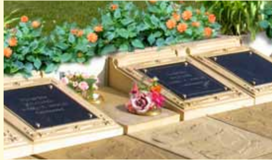
Below ground vaults provide clean burial facilities in all weathers.