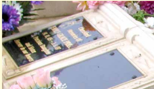
Cover plates are secured with anti-tamper locking screws.