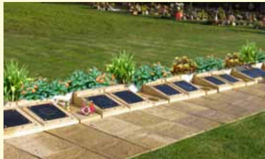
Inscriptions can be prepared for the day of the funeral.

Please feel free to visit the cemetery where our staff will be glad to assist with any enquiries.